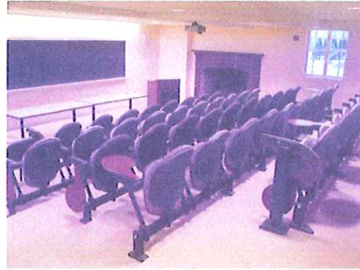
One of Three State of the Art Classrooms in Downey House